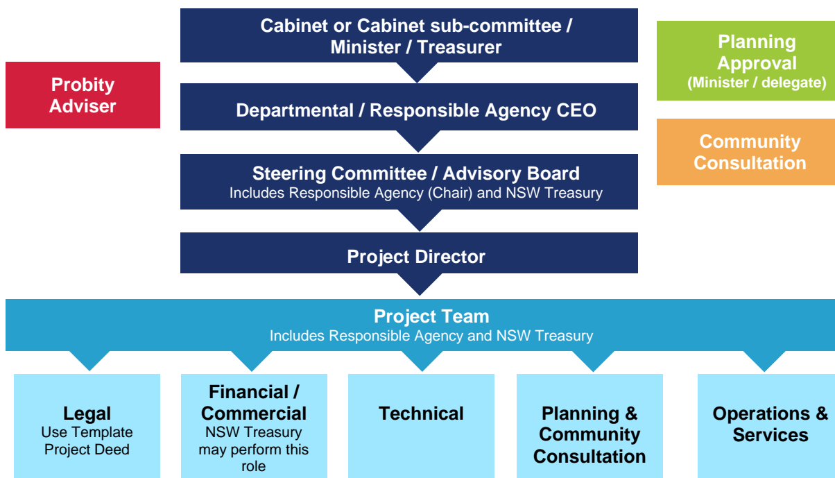
Figure 4.1. Typical project management structure

Figure 4.1 outlines a typical high-level project management structure for NSW PPP projects.